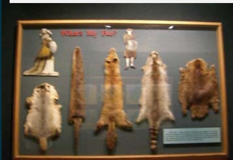
Different types of fur was traded between the French, British and American Indians.